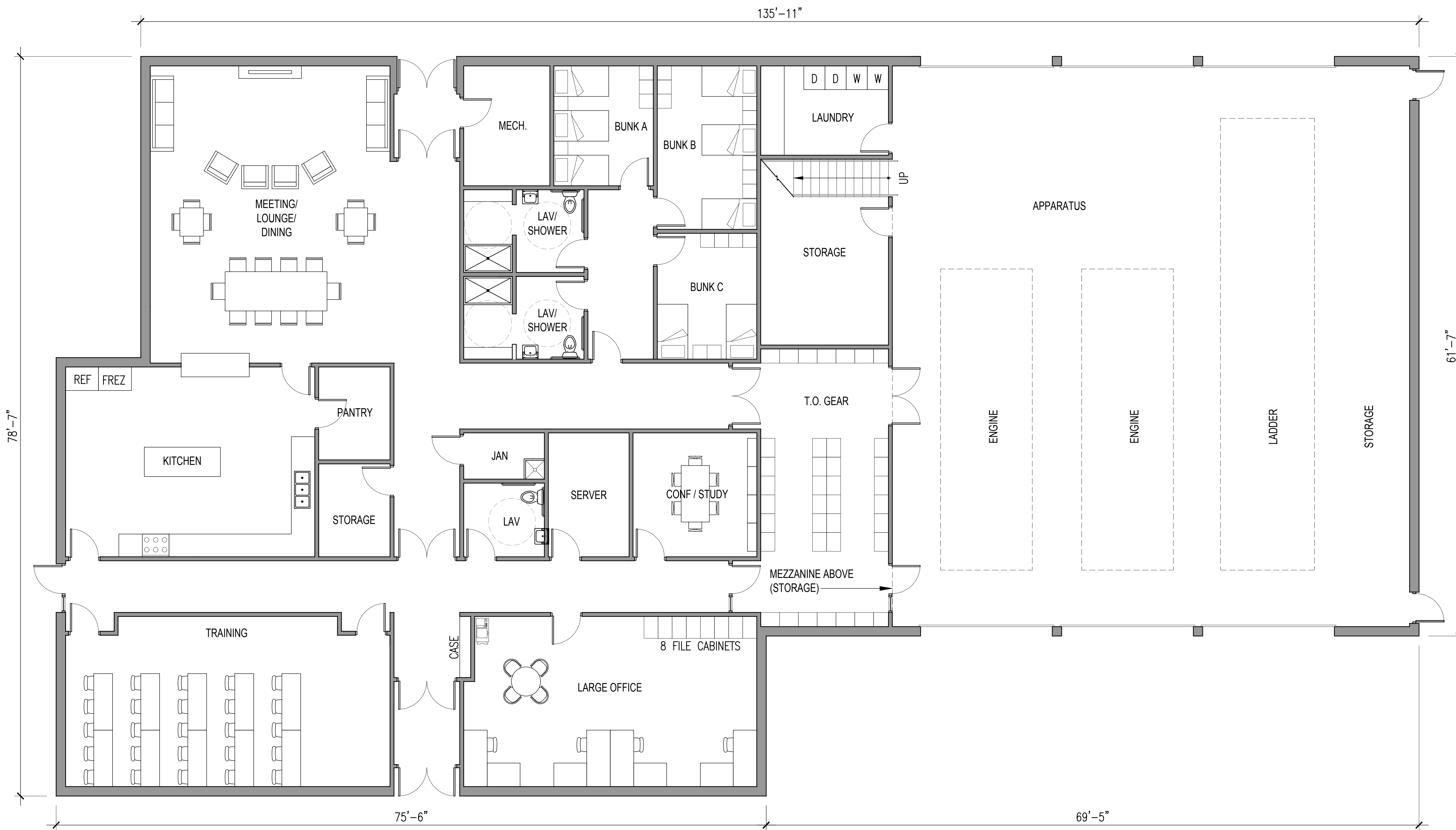
1 CONCEPTUAL PLAN SF: 9,920 3/16"=1'-0"